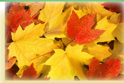
English Hills 2010 Fall Picnic